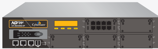
Flexi Ports Module